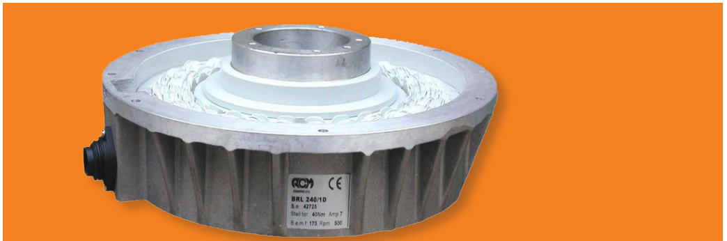
Direct drive servomotors